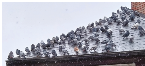
FIG. 1. Birds sitting in a winter time on a roof with an appreciable inclination angle, augmenting by their extremities the friction effect while occupying the tessellated surface of the roof.

Friction is a physicochemical phenomenon ubiquitous in nature and technology as it is often accompanied by lubrication and wear. In natural environmental conditions it unveils decisively all weaknesses of both planning and materializing the constructions and buildings that emerge thanks to human as well as non-human activities. As for the former certain famous churches such as the Wang church in Karpacz built almost without any nail can be mentioned. In the latter, bird or ants' nests are other examples worth to analyze. All of those constructions invoked employ certain intrinsic and/or extrinsic friction conditions, arising with an aid of load, thus ever present gravitation, that show up efficiently as safe spots for human beings and other living creatures (see Fig.1).