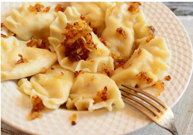
The famous polish dish pierogi :3