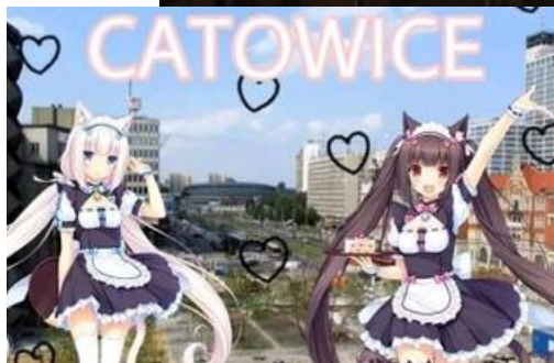
Worlds biggest gas burner looks like the one in the oven :D aka the "spodek". This building is placed in the city of Katowice