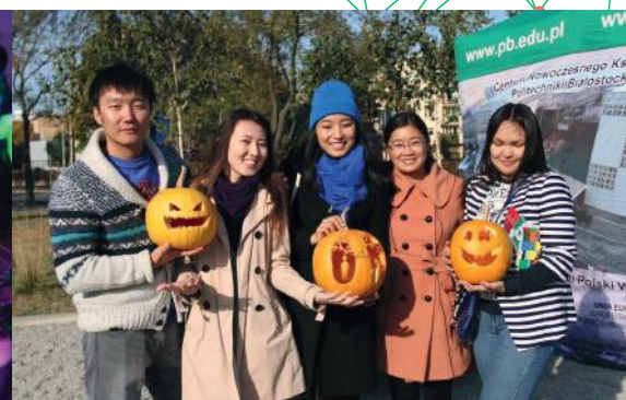
Welcome Pumpkin Party