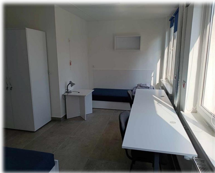
Double room adapted for people with disabilities in Beta Student House

Any person with a documented disability may apply for a scholarship for disabled students (PLN 1200 - light degree, PLN 1500 - moderate degree, PLN 2000 - severe degree).