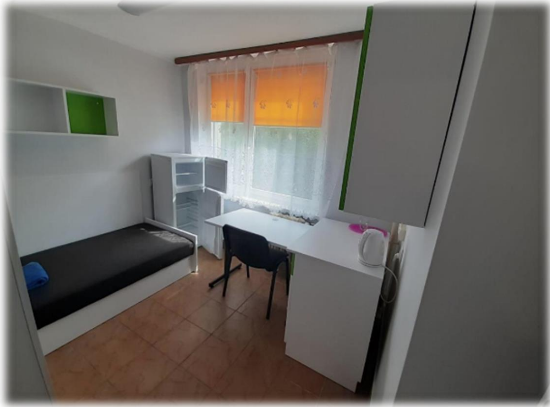
A single room adapted for people with disabilities at the Student Dormitory Gamma