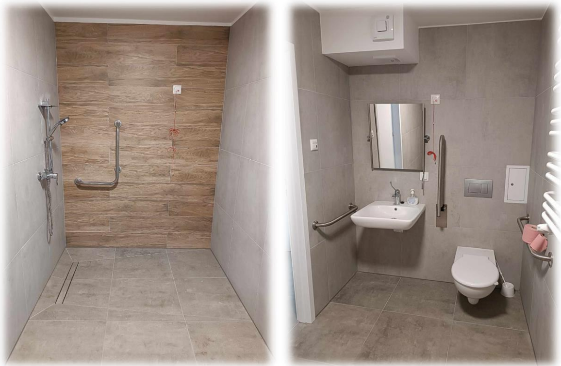
A bathroom adapted for people with disabilities at the Student Dormitory