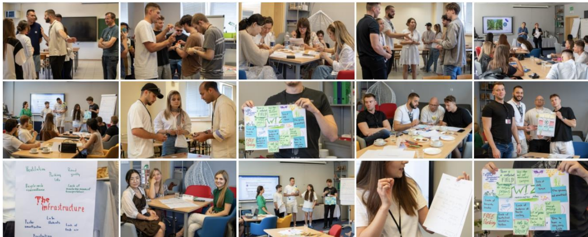
International Summer School 2025 – intercultural cooperation for sustainable development

From 30 June to 9 July 2025, Bialystok University of Technology hosted the International Summer School 2025, focused on intercultural cooperation and sustainable development. Students and academic staff from various countries participated, fostering skills related to global environmental and social challenges. The programme included lectures, workshops, and team projects addressing topics such as sustainable development, cultural diversity, and practical tools for international cooperation. Sessions were delivered by experts from partner universities and practitioners involved in Sustainable Development Goals (SDGs) activities. Participants enhanced intercultural communication, teamwork, and project-based skills, and exchanged experiences on implementing sustainable development initiatives in their home countries. The summer school formed part of the university’s strategy for internationalising education, promoting intercultural cooperation, and preparing young professionals to address global socio-environmental challenges.