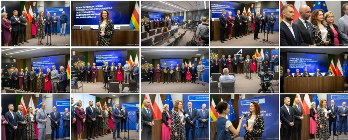
“Innovation Ecosystem Agricultural Valley 4.0” project