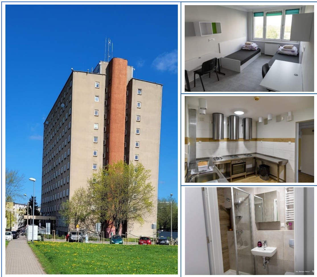
Student Dormitory No. 5 Epsilon